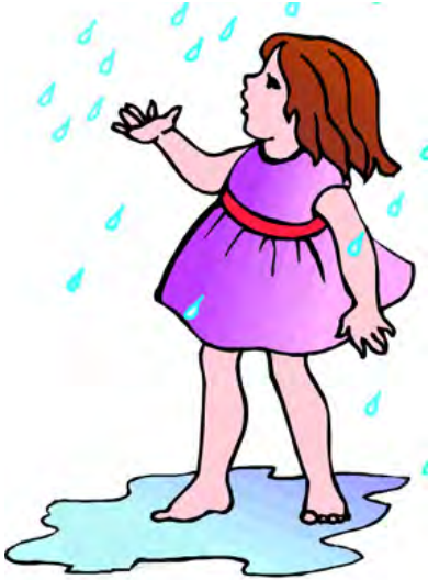
meisje / regen

Create a sentence for each picture using „in“ with the help of the Dutch words.