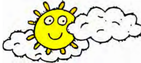
zon / wolken