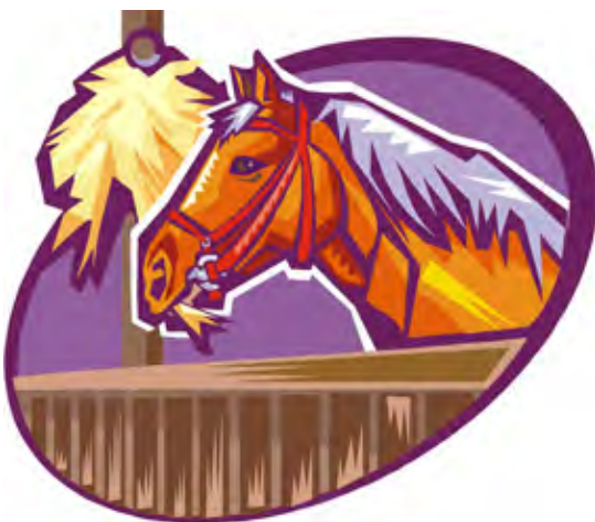
paard / stal