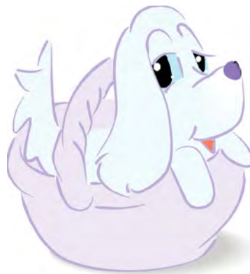
hond / mand